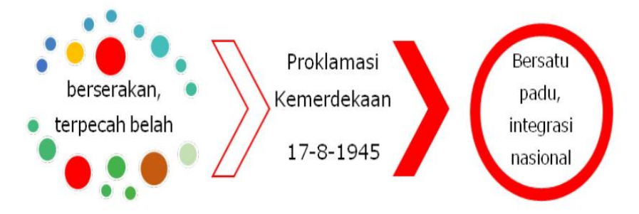
Figure 1: Proclamation of Indonesian Independence is a process of integration of the Indonesian Nation (Team, 2016: 69)

Multicultural Education can uphold regional dignity and dignity by continuing to promote equal status as a member of the Unitary State of the Republic of Indonesia. Indonesia as a nation state that has multicultural and even pluralistic societal characteristics becomes its own challenge to remain integrated in a single unified frame of diversity (Cuga, C. and Yuliadhani, 2013).